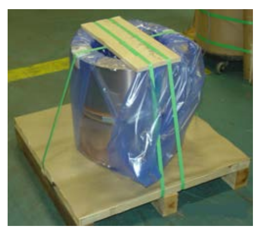
Figure 2. Coiled strip wrapped in plastic ready for international shipment.

It is recommended that material be kept at a constant temperature and the relative humidity be maintained below 60% to prevent condensation on the surface of the metal.