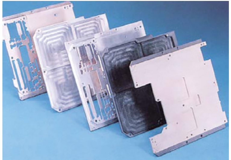
AlBeMet Electronic Components

The computer chips used on this board are so large that the core material had to have low CTE. The low CTE keeps the core from expanding too much during the temperature swings. Large core growth compared to the ceramic chip that does not grow significantly, would break the brittle solder joints. The AlBeMet composite CTE is much closer to that of the electronic chip. This kept the stress in the solder joint to a minimum.